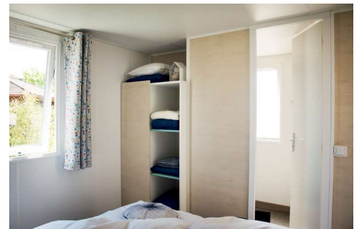
En-suite shower room with the master bedroom